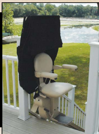
OUTDOOR ELECTRA-RIDE™ ELITE Model SRE-2010E

Home accessibility solutions and automotive products