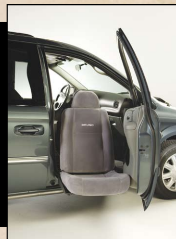
TURNING AUTOMOTIVE SEATING™ (TAS™)

Founded 25 years ago, Bruno Independent Living Aids, Inc., is a world-wide manufacturer of accessibility products designed to enhance the lives of those challenged by limited mobility. In pursuing this goal, Bruno is proud to be the only U.S. manufacturer of indoor/outdoor stairlifts, interior/exterior scooter, powerchair and wheelchair vehicle lifts and Turning Automotive Seating™ (TAS™) products to be ISO 9001 Certified. This is one of the most stringent, widely-recognized quality standards in the world and your assurance that Bruno is committed to providing you with the highest-quality, most reliable products in the industry. Ask your certified Bruno dealer for details on all Bruno independence products.