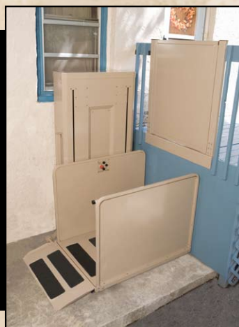
VERTICAL PLATFORM LIFT

The only 400 lb/181.8 kg capacity outdoor stairlift... an INDUSTRY EXCLUSIVE!